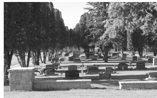
Mt. Calvary Cemetery, Sumner

If you wish to make a donation for the upkeep of the cemeteries in St. Joseph the Worker Cluster, please use the Cemetery Envelope in your box.